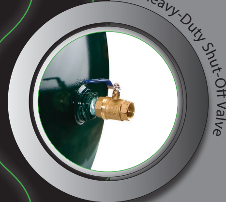
Heavy-Duty Shut-Off Valve