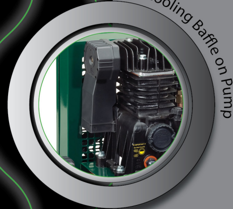
Cooling Baffle on Pump