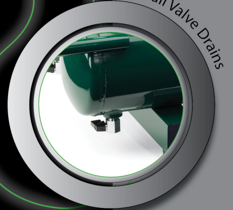
Ball Valve Drains