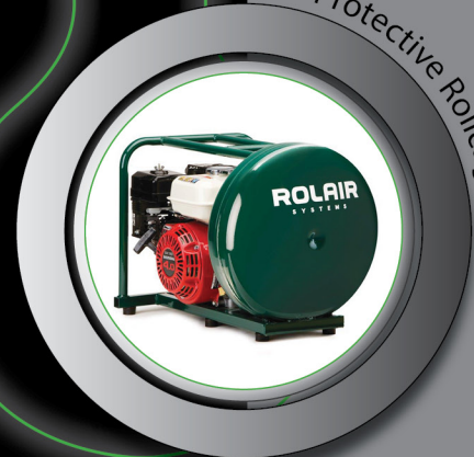
Protective Rollcage Frame