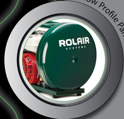
Low Profile Pancake Tank